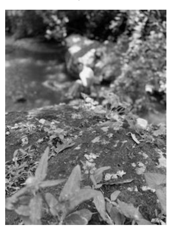
Est. 1982 A Ministry of Bethel Campgrounds, Inc.